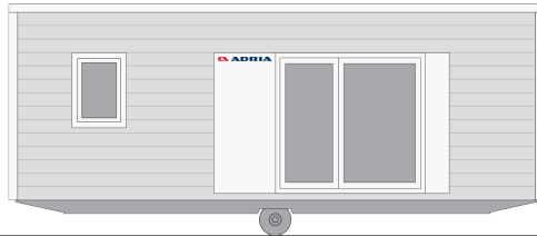
SLine 804 F31T