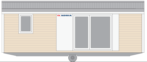
SLine 804 F31T