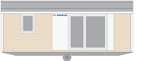
SLine 754 F21