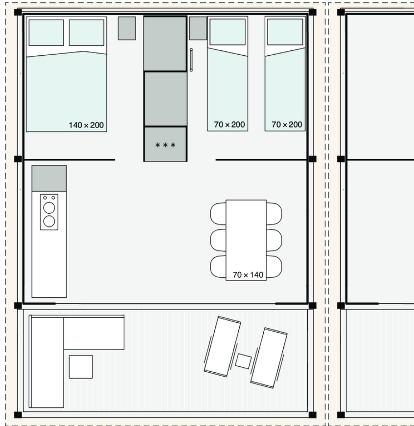
Adriatic M Comfort