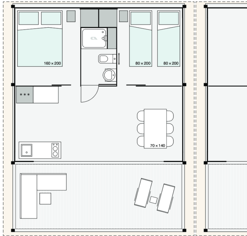
Adriatic L Comfort+